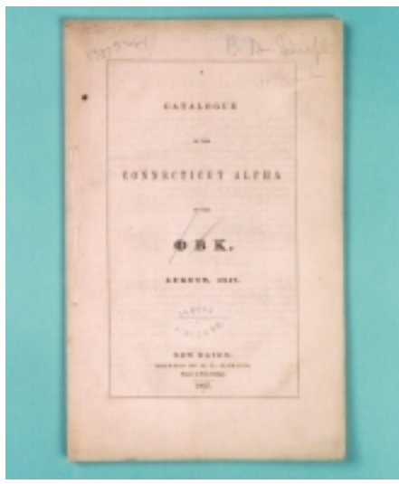
The 1847 catalog of Yale's ΦBK chapter includes members of Congress, diplomats, and college and university presidents.

overlapping stamped lines that say, "Harvard College Library" and "Massachusetts State Library." "May 31, 1938" is written in pencil.